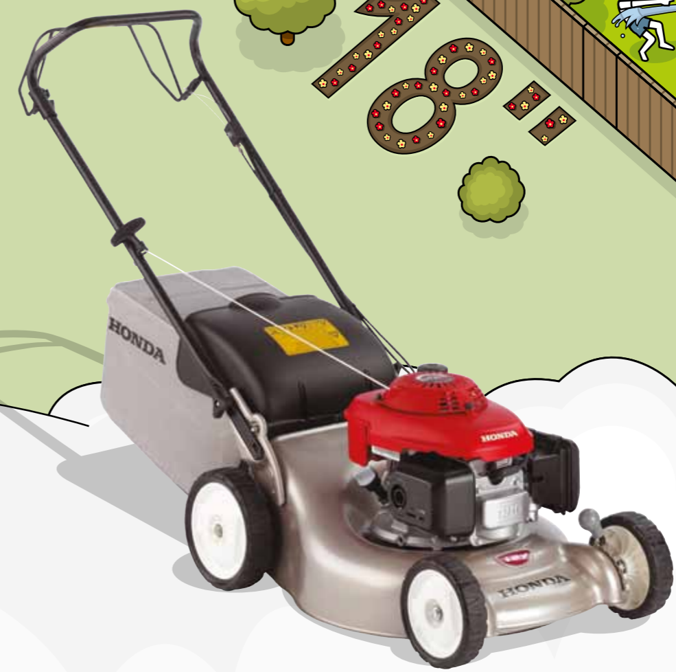
HRG 415 PD Shown