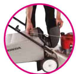
Redesigned cutter deck Delivers optimal airflow resulting in outstanding grass collection.