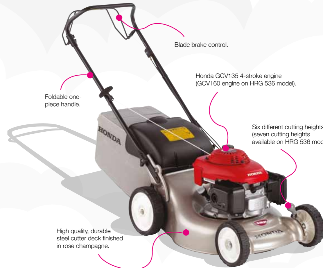
Blade brake control.