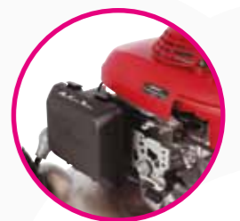
Auto Choke System Ensures the perfect engine start setting whatever the weather.