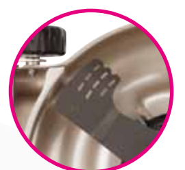
Unique blade design 30% noise reduction for noticeably quieter operation.